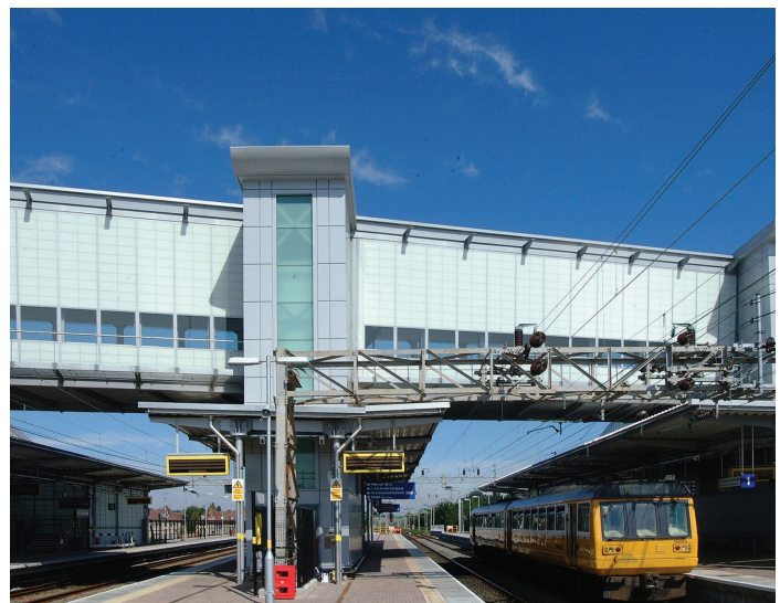
Liverpool South Parkway Interchange | Liverpool, UK Jefferson Sheard EGS