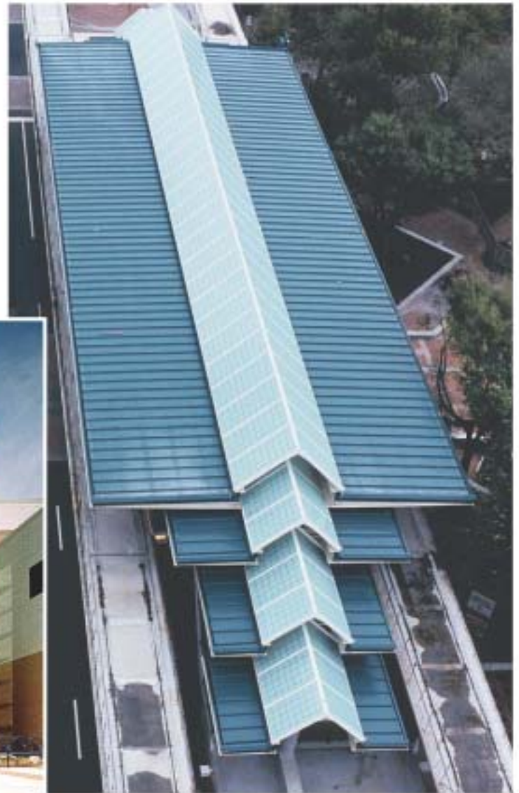
Jacksonville Transformation Center, Jacksonville, FL; VRL Architects, Inc.