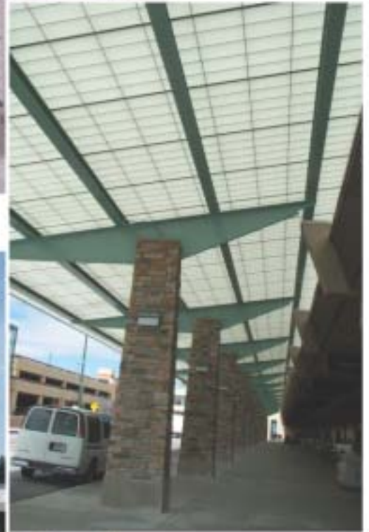
Reno-Tahoe Airport, Reno, NV Tate Snyder Kimsey Architects