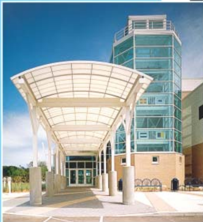
Mona Stokes High School, Mona Stokes, MI; URS Greiner Architects