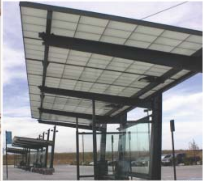
RTD Civic Center, Denver, CO; Studio Complaniva, Architects