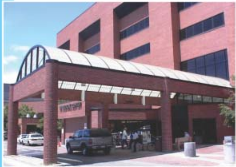
VA Medical Center, Denver, CO Carl Wilkey, AIA

The diffuse properties of Kalwall offer the added benefit of filling an enclosed walkway garage entrance or staircase with balanced daylight, while offering security by protecting occupants being seen from outside the structure.