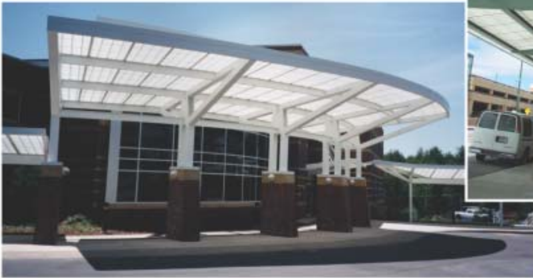
Concord Hospital M.O.B. South, Concord, NH; JSA Inc., Architects