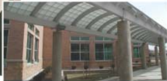
Salt Lake Community College, Salt Lake City, UT; HFS Architects