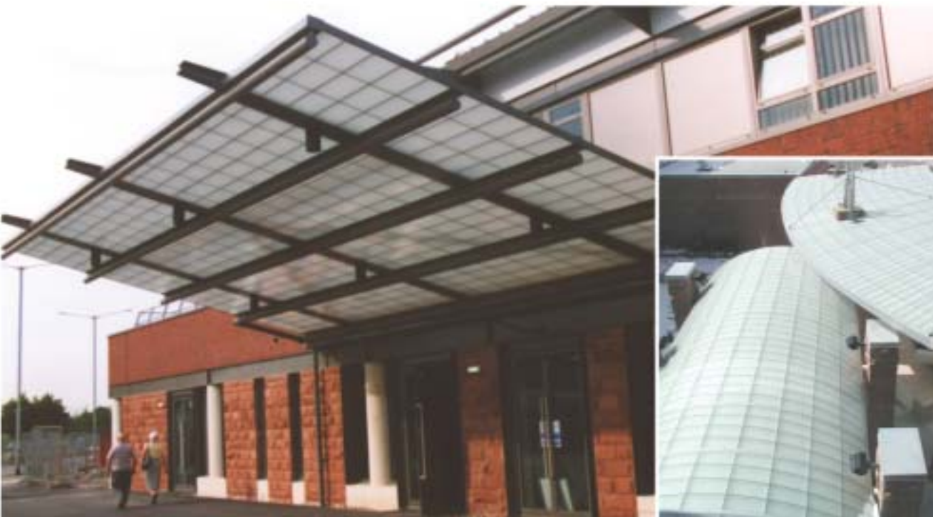
South Tees General Hospital, Middlesbrough, UK; HLM Architects