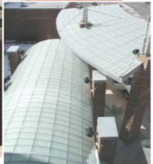
McKay Dee Hospital, Ogden, UT; Architectural West Design