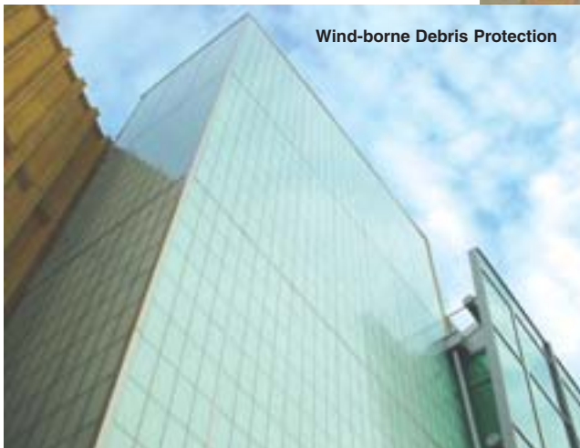
Wind-borne Debris Protection